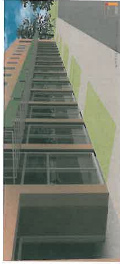
Front Facing Southeast